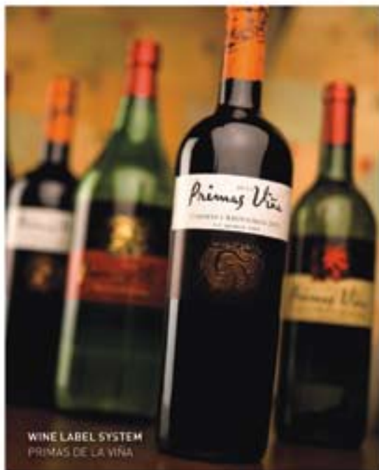
WINE LABEL SYSTEM PRIMAS DE LA VINA