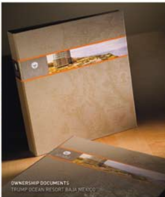
OWNERSHIP DOCUMENTS TRUMP OCEAN RESORT BAJA MEXICO