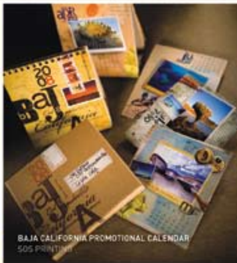
BAJA CALIFORNIA PROMOTIONAL CALENDAR SOS PRINTING