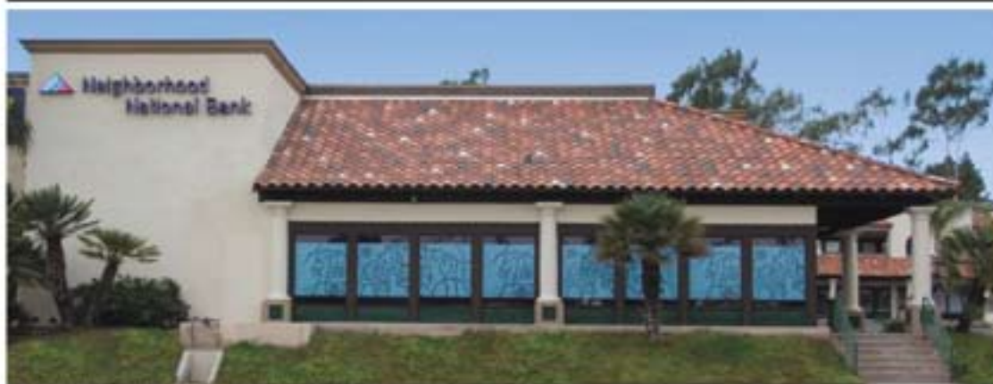
BRANDING, SIGNAGE & ENVIRONMENTAL GRAPHICS NEIGHBORHOOD NATIONAL BANK

EXPERT BRAND and CORPORATE COMMUNICATIONS for COMPANIES, PRODUCTS, SERVICES, ENVIRONMENTS and EVENTS ▶ ▶